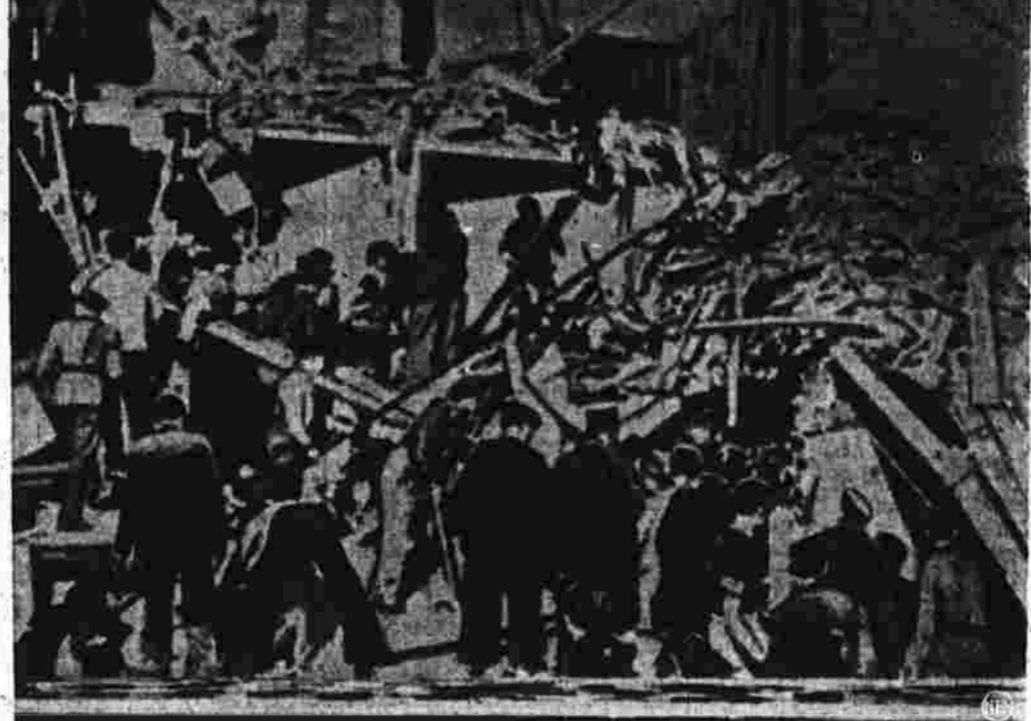
Nineteen air-raids in less than forty-eight hours by "Spanish" rebels flying German and Italian bombers, snuffed out the lives of approximately 1,900, wounded approximately 2,000 more and pulverized a large section of the once-beautiful city of Barcelona in Loyalty Spain. The radiophoto above first to reach the United States, shows rescuers-walkers at the gruesome task of sifting debris for mangled corpses of men, women and children. Hundreds are still in the wreckage. Along with bombs, the raiders from the sky dropped leaflets demanding that Barcelona "surrender or perish".